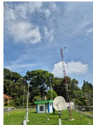
Figure 1. Automatic Weather Station

December 2024, with data resolution aggregated to hourly intervals.