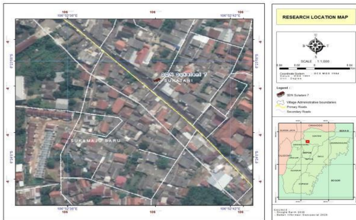
Figure 1 Research Flow Diagram

Administratively the location of the activity is located on Jl. Pekapuran No. 45, Sukatani, Tapos District, Depok City, West Java. Research location map was presented in figure 1, and the study was conducted from February to May 2020.