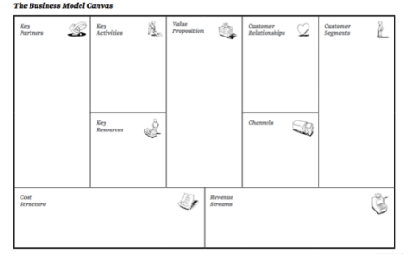
Figure 1 Template Business Model Canvas (Source: Osterwalder & Pigneur, 2010)

and builds relationships with them. The fifth element is revenue streams, which identifies the different ways the company earns revenue from its products or services. The sixth element is key resources, which are the essential assets the company needs to operate and deliver its value proposition. The seventh element is key activities, which are the crucial actions the company takes to create value for its customers. The eighth element is key partnerships, which describes the collaborations or relationships the company has with other businesses or organizations. The final element is cost structure, which identifies the expenses and costs associated with operating the business model. By considering each of these nine elements, companies can create a clear and effective business model that meets the needs of its customers while generating revenue and maintaining profitability.