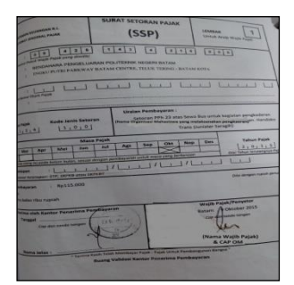
Fig. 4. SSP Pph Pasal 23

Proof of tax compulsory deposit top attached as evidence supporting the use of lease transactions over the bus. The following can be seen in Figure 5 below: