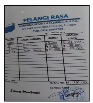
Fig. 7. Nota

catering services for any use. The following examples of evidence which can be seen in Figure 7 below: