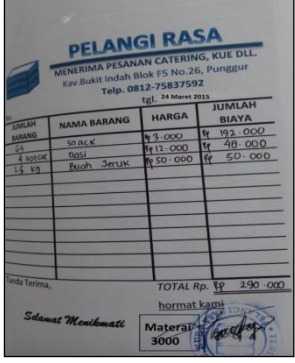
Fig. 8. Note Payment Catering

Evidence of the transaction should be attached in the reporting of LPJ activities in accordance with Minister of finance REPUBLIC of INDONESIA No. 141/pm. 03/2015 About other types of services referred to in article 23 paragraph 1 Letter C number 2 for the use of the services of catering indebted PPh Pasal 23 and the mechanism is the same as the example of the first case, and according to Government Regulation No. 24 of 2000 regarding changes to the customs tariff postage labels to face transactions above Rp250,000 to Rp1,000,000 indebted Bea 3000 postage labels. Its format can be seen in Figure 8 below: