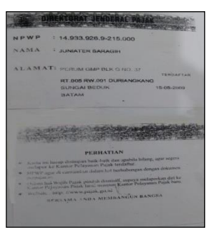
Fig. 6. NPWP Tax Payers

Number of principal taxpayers need to be attached as supporting evidence if a provider/rent have NPWP. Here's an example can be seen in Figure 6 below: