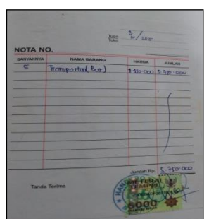
Fig. 3. Proof of Payment Transaction

In accordance with Government Regulation No. 24 of 2000 regarding changes to the customs tariff postage labels, then to face transactions above Rp1.000.000 in proof such transactions indebted 6000 postage labels. As for an example can be seen in Figure 3 below: