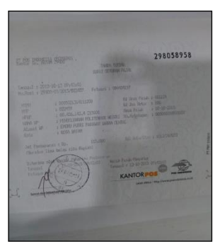
Fig. 5. Deposit of income tax Article 23

Proof of tax compulsory deposit top attached as evidence supporting the use of lease transactions over the bus. The following can be seen in Figure 5 below: