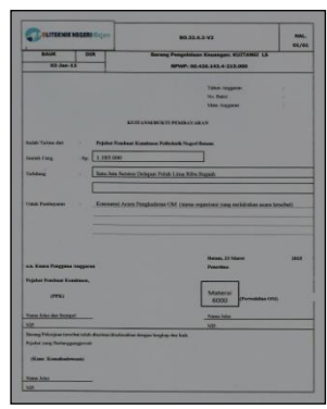
Fig. 9. Receipts LS Event

not fit the standard obtained upon purchase transaction in such traditional markets as proof of receipts documenting grocery items as well as LS that has been purchased. The following examples use receipts LS can be seen in Figure 9 below: