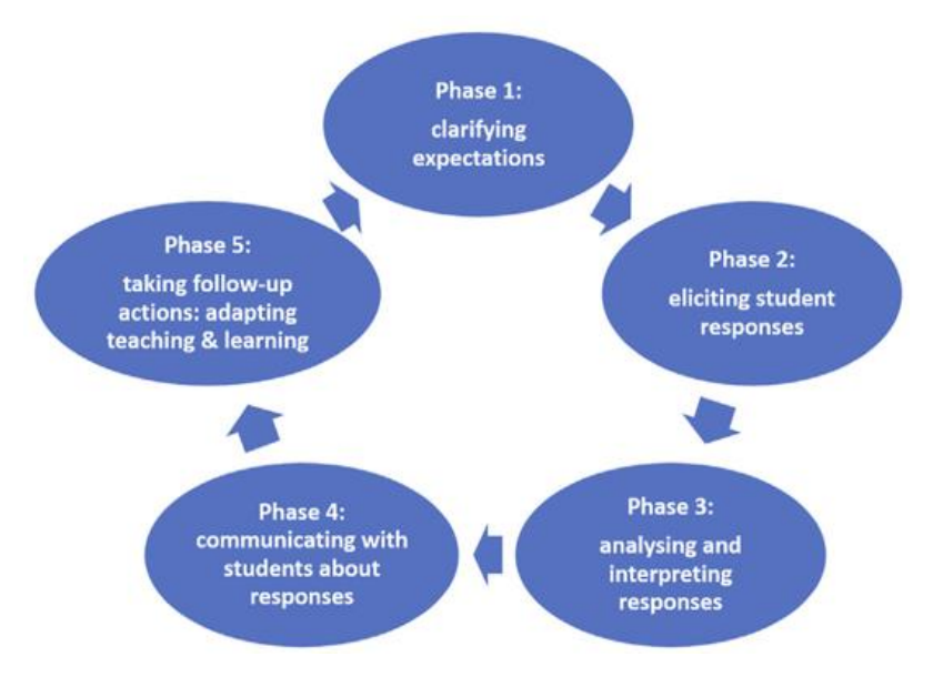
Figure 1 Five Phase FA Cycle (Gulikers and Baartman (2017)

Considering current challenges and issues that ESP teachers meet in their FA practices, explicit guidelines (See Figure 2) are proposed in this study as reference for policymakers and related departments to develop best practices in ESP FA. Following Gulikers and Baartman (2017) five-phase FA cycle (See Figure 1), it integrates periodical training specific for ESP assessment within blended learning mode and periodical check on teachers' FA practices by teaching supervisors and head of unit while providing timely and supervisory feedback and guidance. Meanwhile, maintaining policy of teachers' internship practice, typical work cases will have to be formulated through collaboration and periodic discussion between teachers and trading company employees.